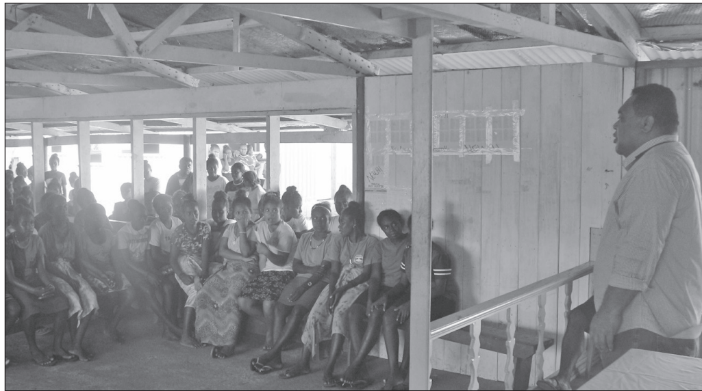
Gov speaks to teachers and students of Choiseul Bay P.S.S..