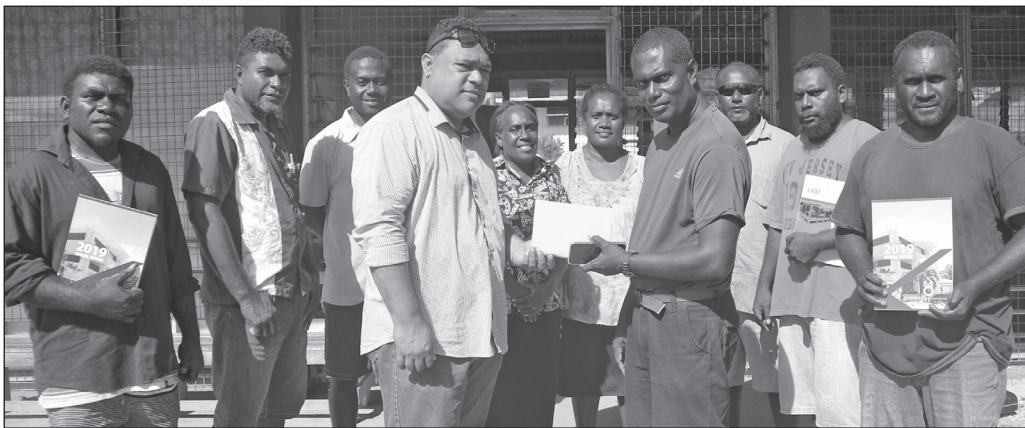
Gov hands over donation to Principal and teachers of Choiseul Bay P.S.S.

THE Central Bank of Solomon Islands (CBSI) led by Governor Dr Luke Forau made a special visit to the Choiseul Bay Provincial Secondary School last week, and donated $10,000 along with economic resources (reports) to support the school and its students.