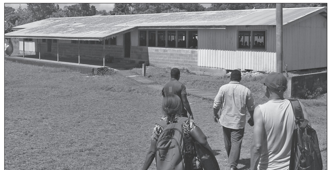
Gov and team led by Principal of C.B.P.S.S to the school hall.jpg